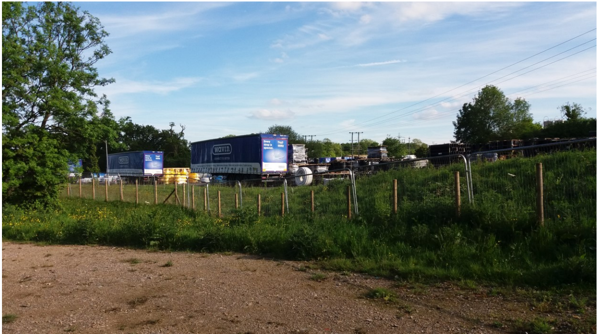
Photos taken from footpath LBUR 5

There is non-conformity with Core Policy 51 which states: